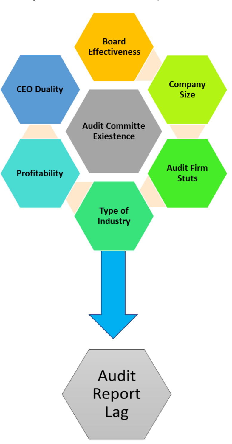
Figure 2: The research theoretical framework